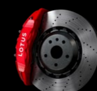
6 PISTONS - FRONT RED CALIPERS