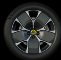
20" 5-SPOKE AERO WHEEL