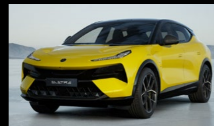
SOLAR YELLOW OPTION FOR ELETRE S ELETRE R