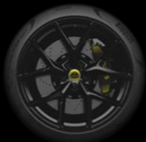
22" 10-SPOKE GLOSS BLACK WHEEL