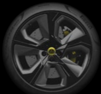
22" 5-SPOKE GLOSS BLACK WITH CARBON FIBRE TRIM