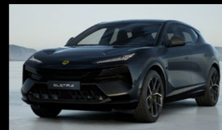
STELLAR BLACK OPTION FOR ELETRE ELETRE S ELETRE R