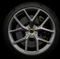
22" 10-SPOKED DIAMOND CUT GREY WHEEL