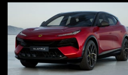
NATRON RED OPTION FOR ELETRE S ELETRE R