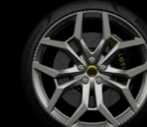
23" MULTI-SPOKE DIAMOND TURNED SILVER WHEEL