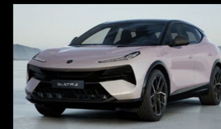
BLOSSOM GREY OPTION FOR ELETRE S ELETRE R