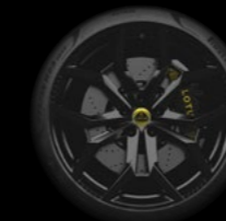
23" MULTI-SPOKE GLOSS BLACK