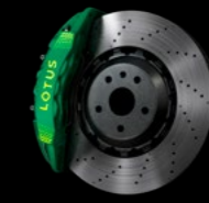
6 PISTONS - FRONT GREEN CALIPERS