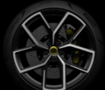
22" 10-SPOKE DIAMOND CUT SILVER WHEEL