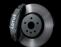
4 PISTONS - FRONT GREY CALIPERS