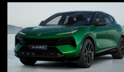
GALLOWAY GREEN OPTION FOR ELETRE S ELETRE R