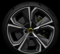
22" 5-SPOKE DIAMOND TURNED GREY WHEEL WITH CARBON FIBRE TRIM