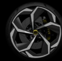
23" 5-SPOKE DIAMOND TURNED GREY WHEEL WITH CARBON FIBRE TRIM