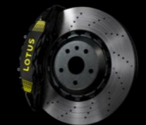
6 PISTONS - FRONT BLACK CALIPERS