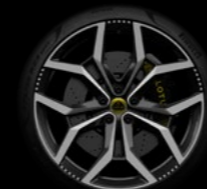
23" MULTI-SPOKE DIAMOND TURNED GREY WHEEL