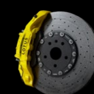
10 PISTONS CARBON CERAMIC YELLOW