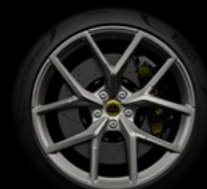
22" 10-SPOKED DIAMOND CUT GREY WHEEL