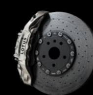
10 PISTONS CARBON CERAMIC METALLIC SILVER