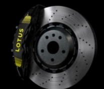
6 PISTONS - FRONT BLACK CALIPERS