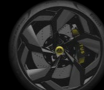
23" 5-SPOKE GLOSS BLACK WITH CARBON FIBRE TRIM