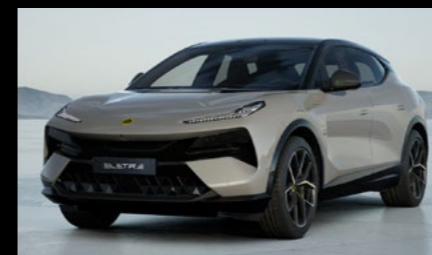
KAIMU GREY STANDARD FOR ELETRE ELETRE S ELETRE R